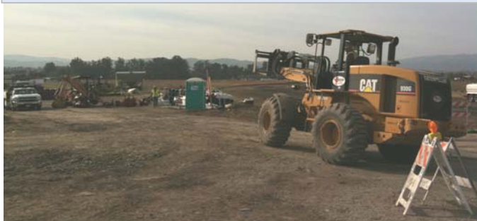
View of crews working on utility relocation and grading north of I-580 at Isabel Avenue (11/09)