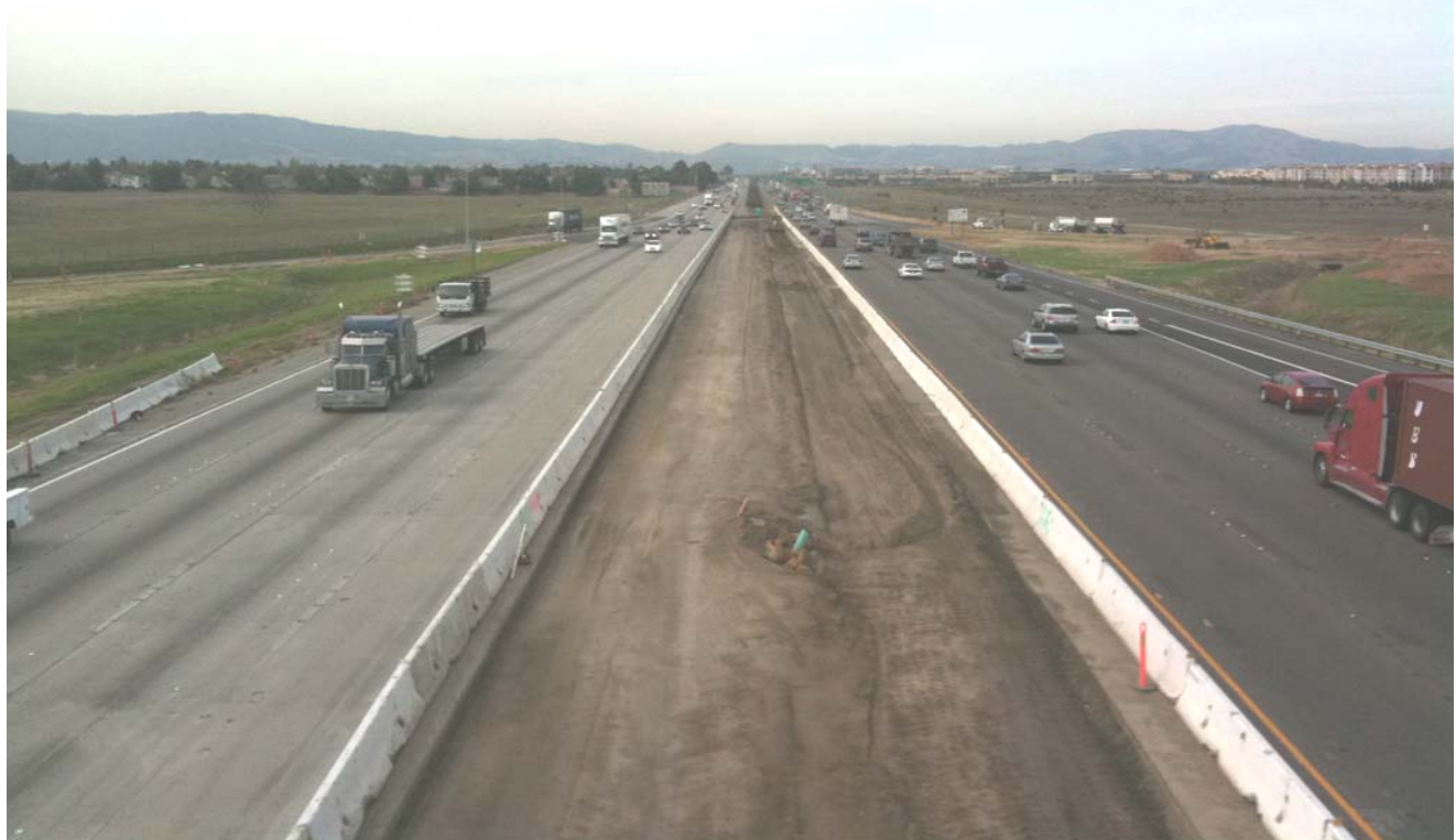
View of Interstate 580 looking west from Fallon Road Median construction in progress to create room for eastbound auxiliary lane (11/09)